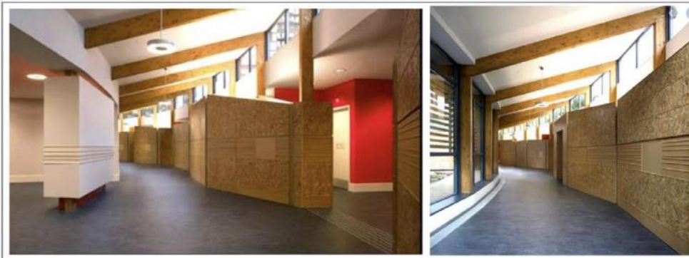
Figure 4. Hazelwood School