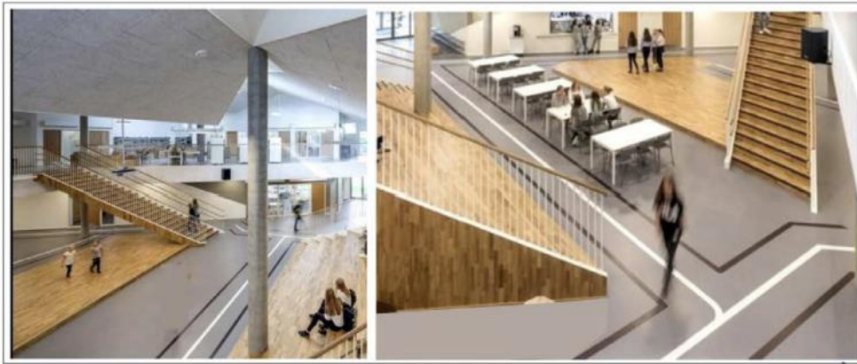
Figure 3. Skovbakke School

• safety principle : takes into account the ability to move in the required direction (Skovbakke School design, Anchor Center, Hazelwood School design (Figure 4), Bergen School design). These examples indicate the professionalism of identifying the tactile qualities of objects characterized by the activation of the communicative function;