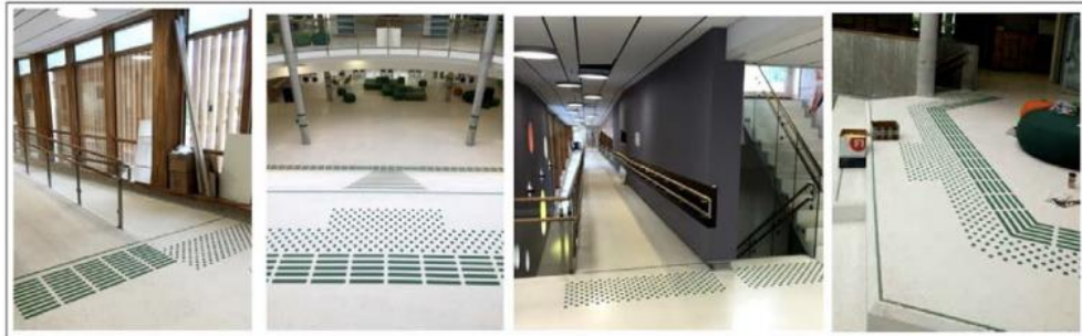
Figure 5. Bergen School

2) tactile warning indicators in areas of change of direction (school design for girls, Melbourne; Bergen School design (Figure 5)).