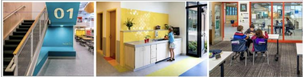
Figure 1. Browns Point Elementary School, TCF Architecture

that meets the needs of visually impaired students is one of the means of solving the problem of visual communication in the school space, they are perceived as informational assistance in addressing issues of orientation and, subsequently, in socially oriented activities (Figure 1).