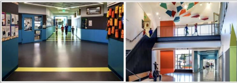
Figure 2. Lake Wilderness Elementary School

To determine the function of navigation in the formation of the design of the Peter G. Schmidt Elementary School (Tacoma, WA), the architects of TCF Architecture use the collage method. This method allows you to combine in one room several information accents, which are decided by the local type of their location: photos, text messages, active use of bright colors and embossed materials for fencing. First of all, we should pay attention to the definition of the principle of safety, which is one of the basic principles of universal design, proposed by architect Ron Mace. Therefore: