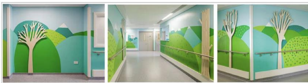
Figure 6. Royal London Hospital

symbolic images with realistic – all the above components prove that in the design of children’s hospitals at the beginning of the XXI century a new trend was developed, which in the complex of all signs is responsible for the harmony and comfort of the medical space – reception of receiving a combination of tactile elements with graphics . For example, the design authors of Royal London Hospital laconic on the basis of the above admission reveal the meaning of the concept of “natural” (Figure 6).