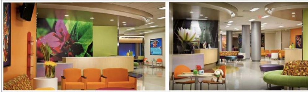
Figure 4. Phoenix Children's Hospital / HKS Architects

The natural process of knowing the child of the natural world today is due to the active use of photos in the design of medical institutions. Modern printing services are an affordable means of obtaining the desired result in creating the necessary artistic image. The analysis of visual material showed that the modern objects of children's hospitals reveal the meaning of the concept of "naturalness" by means of photographs using the following artistic techniques: 1) contrast of color-tone relationships; 2) receiving a larger scale; 3) equilibrium of image elements (Figure 4).