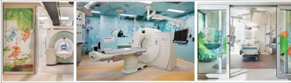
Figure 1. Royal Children’s Hospital in Melbourne, Australia

of the Royal Children’s Hospital, designers choose travel topics as a way of reference in the space of a healthcare facility. Each floor forms its own interpretation of the design concept of “naturalness” through the following changes in visual-graphic language: 1) each floor has its own composition, which is solved by a color scheme, which is not repeated on the other floor; 2) the clarity of the linear pattern is transformed into a large number of background color spots, the expressiveness of which is complemented by the drawing; 3) the compositional content of the panel is solved using 3-4 colors.