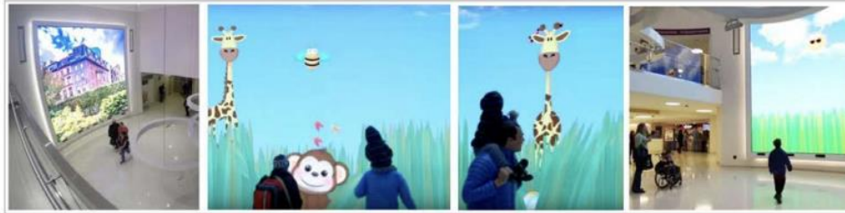
Figure 8. Interactive Media Wall at Boston Children's Hospital

on cognitive-educational function. New technologies allow the storyline to be revealed with bold, non-standard 3D tools and, most importantly, to reduce stress. Feeling in the virtual world, the child changes the perception of the outside world and perceives emotionally and physically offered fleeting artistic images of the deep-spatial composition (Figure 8).