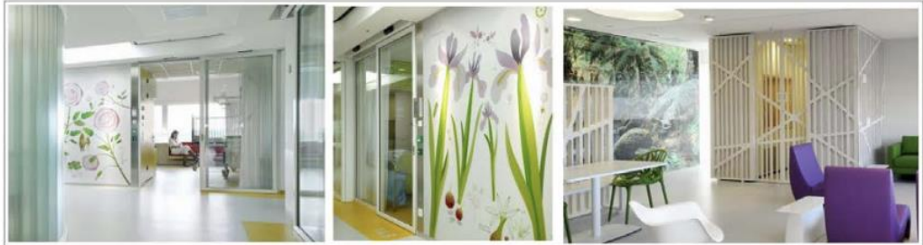
Figure 3. Emma Children's Hospital in Amsterdam, the Netherlands

to the tension and understanding that in this interior – color is an expression of a conceptual idea.