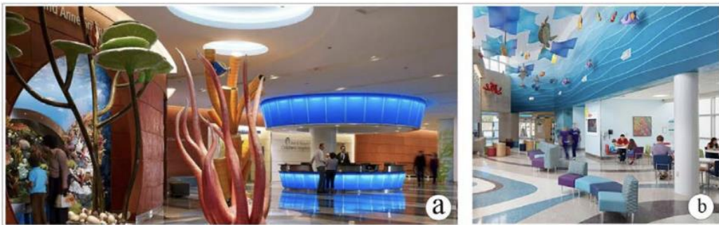
Figure 7. a) Ann & Robert H. Lurie Children’s Hospital; b) Children’s Hospital Therman Statom, Norfolk, Virginia

The introduction of the theme of «sea adventures» in the implementation of the concept of «naturalness» occupies no less important place in the work of modern designers. Consider the basic techniques for creating interiors for children: 1) imitation of the marine landscape in an abstract symbolic language by artificial means of design; 2) design art objects using natural elements: stones, seashells, corals, crabs and more; design art objects using artificial design tools. The informativeness and richness of marine natural resources often gets the attention of designers. A clear example of this is the design of a children’s hospital Ann & Robert H. Lurie Children’s Hospital (Figure 7a).