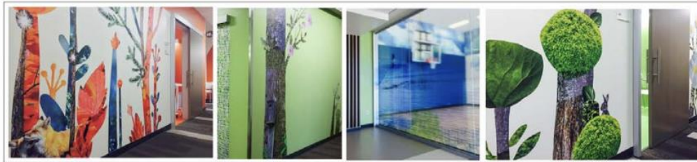
Figure 5. Seattle-Childrens-Hospital-South-Clinic-Earth-hallwa

symbolic images with realistic – all the above components prove that in the design of children’s hospitals at the beginning of the XXI century a new trend was developed, which in the complex of all signs is responsible for the harmony and comfort of the medical space – reception of receiving a combination of tactile elements with graphics . For example, the design authors of Royal London Hospital laconic on the basis of the above admission reveal the meaning of the concept of “natural” (Figure 6).