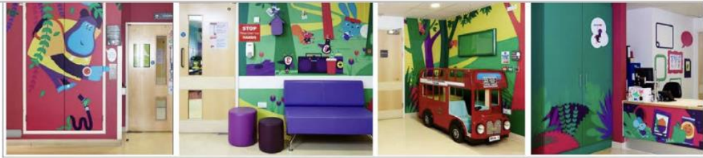
Figure 2. University Children's Hospital (London, UK), Arch. EMMI Studio